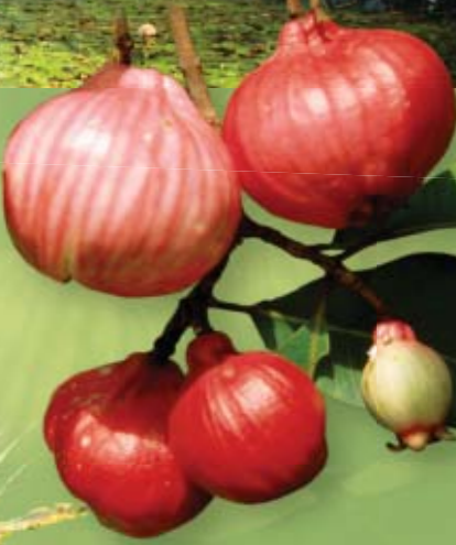
Awin (black bream) favour migeminy (bush apple) when it falls into the River.

At the first sounds of thunder old people feel sad for those who have passed away over the year. The first rain is seen to wash away the footprints in the sand of those who have died and is a time of healing and looking to the future. It is a good sign if a baby is born, takes its first steps or says its first word as the first thunder sounds.